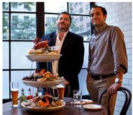
Enlarge This Image