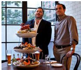
Enlarge This Image